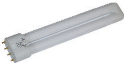
FUJITEC BALUSTRADE LIGHT