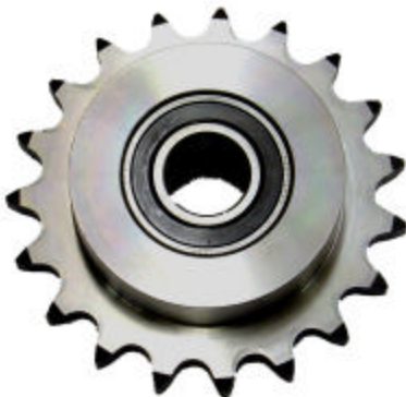
HANDRAIL DRIVE IDLER SPROCKET #12B-19