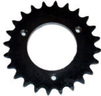
HANDRAIL DRIVE SPROCKET #50-24 WITH TAPPED HOLES