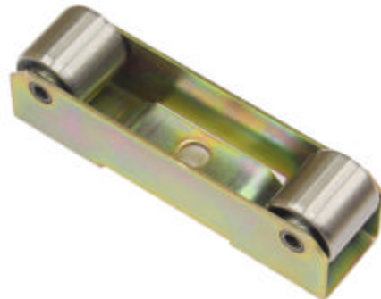
HANDRAIL NEWEL GUIDE ASSEMBLY FUJITEC VS1200 UNIT