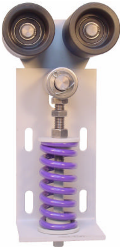
HANDRAIL PINCH ROLLER ASSEMBLY