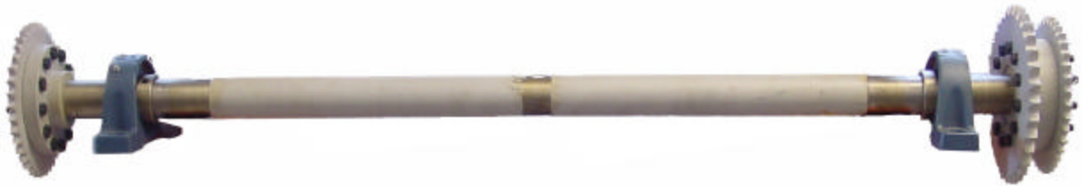
FUJITEC COUNTER SHAFT ASSEMBLY

COUNTER SHAFT ASSEMBLY 50MM COUNTER SHAFT ASSEMBLY 60MM