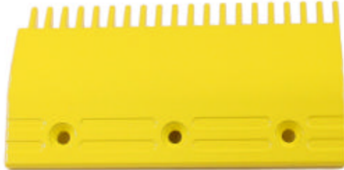
FUJITEC ALUMINUM COMB PLATE LEFT SIDE / CENTER