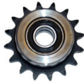
HANDRAIL DRIVE FRAME IDLER SPROCKET #50-12