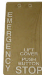
FUJITEC E-STOP SWITCH COVER