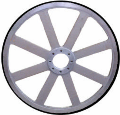
FUJITEC HANDRAIL DRIVE SHEAVE URETHANE MOLDED TIRE

DRIVE SHEAVE "OUTRIGHT" DRIVE SHEAVE "ON EXCHANGE"