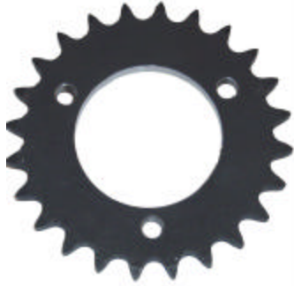
HANDRAIL DRIVE SPROCKET #50-24 WITH THRU HOLES