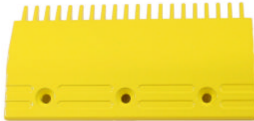
FUJITEC ALUMINUM COMB PLATE RIGHT SIDE