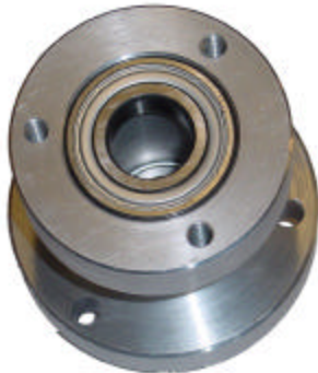
HANDRAIL DRIVE HUB DRIVE SPROCKET / DRIVE WHEEL