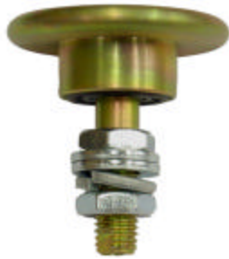
ROLLER—INNER HANDRAIL GUIDE M12 MOUNTING STUD