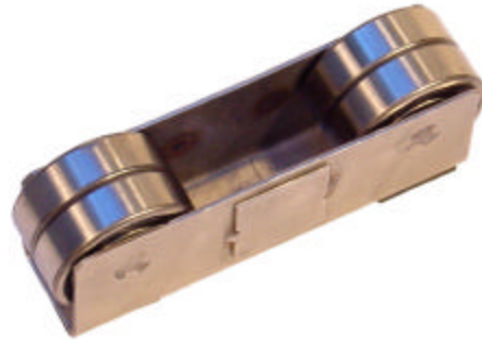
HANDRAIL NEWEL GUIDE ASSEMBLY FUJITEC 1200 TRANSIT UNIT