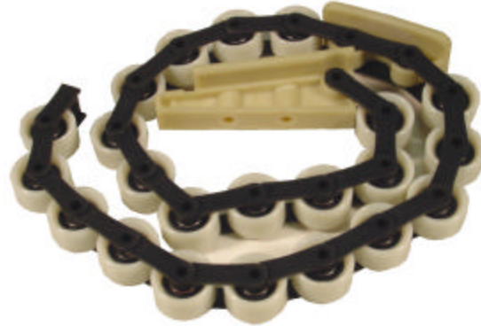
HANDRAIL NEWEL ROLLER CHAIN NYLON FRAME