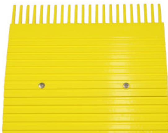
CENTER COMB PLATE 7 3/4" WIDE 22 TEETH

YELLOW ALUMINUM PK1718890Y ALUMINUM PK1718890