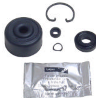
MASTER CYLINDER REBUILDING KIT