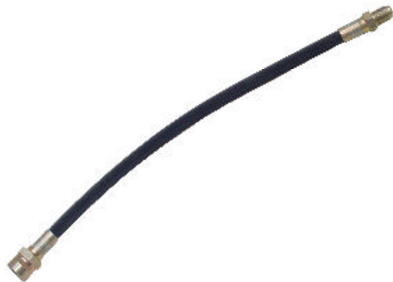
HYDRAULIC BRAKE HOSE