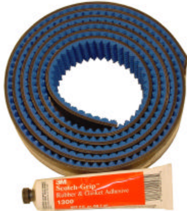
HANDRAIL DRIVE TRACTION BAND WITH GLUE