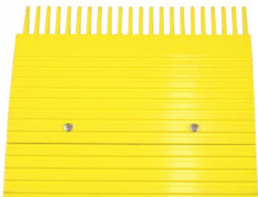
LEFT COMB PLATE 7 15/16" WIDE 22 TEETH

YELLOW ALUMINUM PK1718891Y ALUMINUM PK1718891