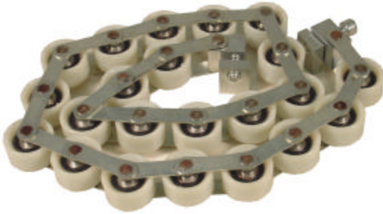
HANDRAIL NEWEL ROLLER CHAIN STEEL FRAME