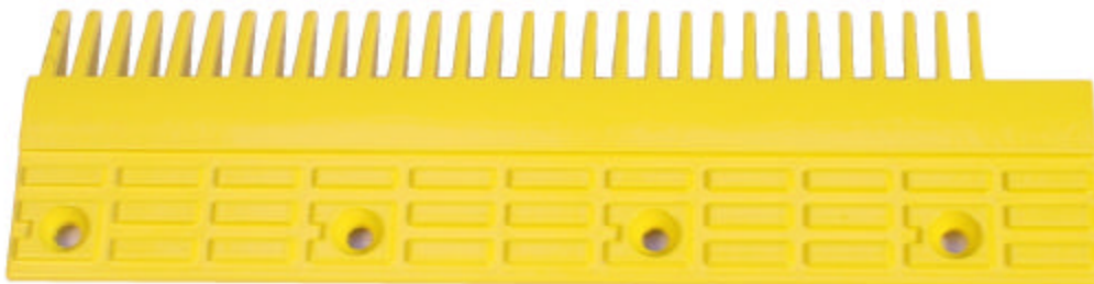
RIGHT HAND COMB PLATE 11" WIDE 30 TEETH