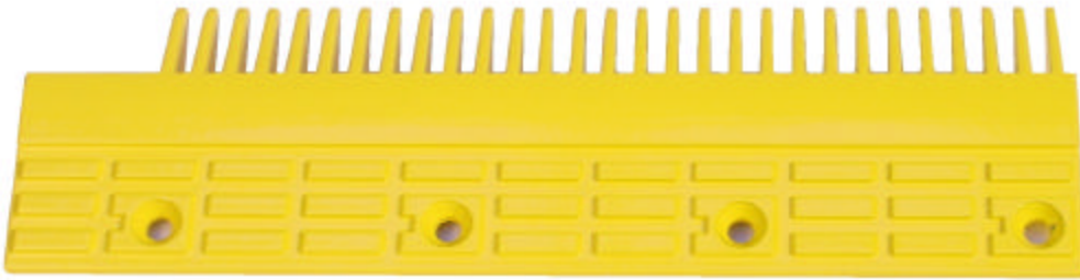
LEFT HAND COMB PLATE 11" WIDE 29 TEETH