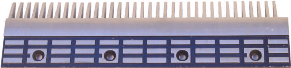
RIGHT HAND COMB PLATE 12" WIDE 35 TEETH